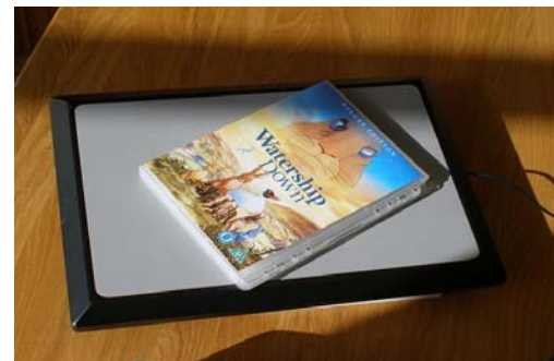
Shielded RFID Pad

Staffpads are available in standard grey, and a special shielded version for area's where power cables and other electrical interferences are unavoidable.