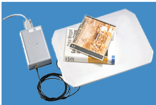
Standard RFID Pad